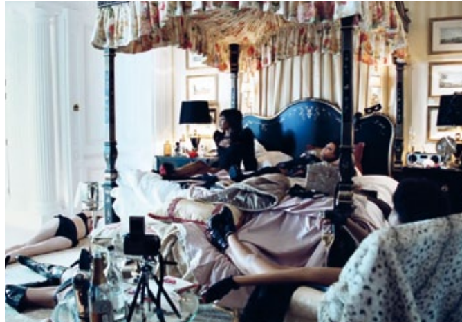
Staring models in Savoy Royal Suite